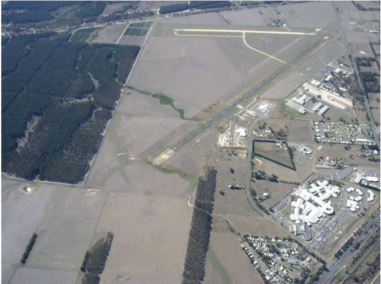
Latrobe Valley Aerodrome